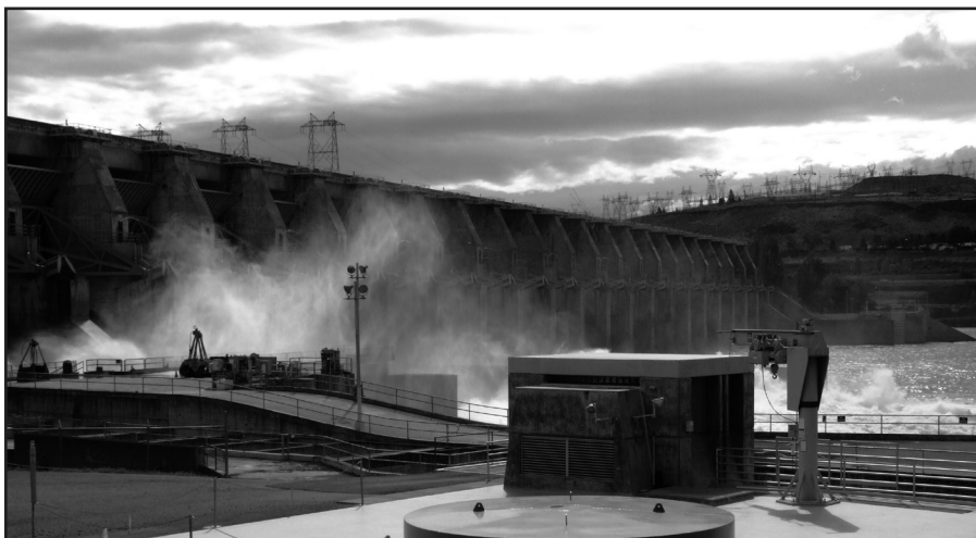
The Dalles Fishway Project on the north shore of The Dalles Dam has proved to be a good investment for NWCPUD. Revenue from the facility has helped insulate PUD customers from many of the rate hikes other utilities have passed on to their customers over the past two decades.

Like the Dalles Fishway Project, the Freedom Project would use attraction water from the dam's north fish ladder for power production. Water entering the system would be screened to prevent juvenile salmon or other small fish from entering the unit's turbine. The Dalles