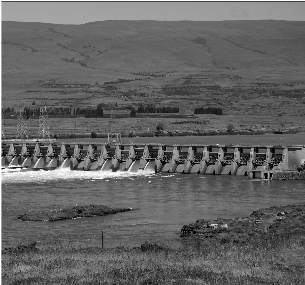
The Dalles Dam, as seen from the Oregon shore of the Columbia River.

Fishway Project is a certified low impact hydro facility.